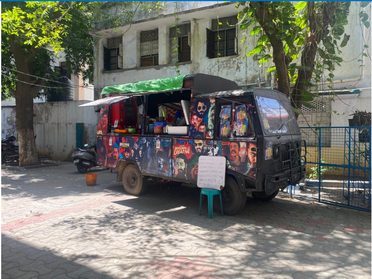
Alumni Startup – Food Truck