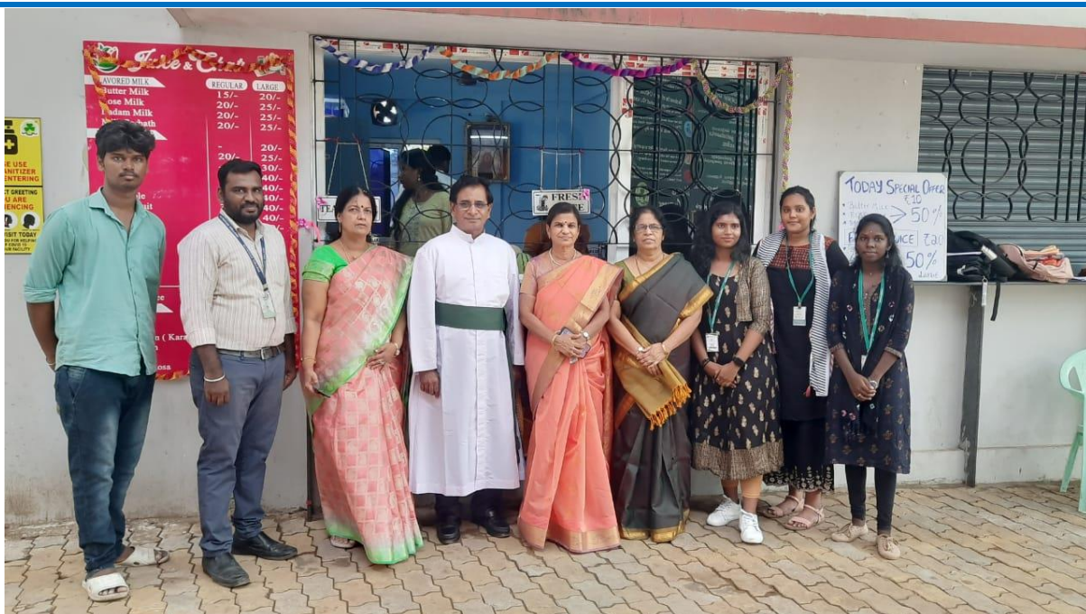
Officials, Faculty and Students at the Newly Inaugurated Patrician Juice Corner