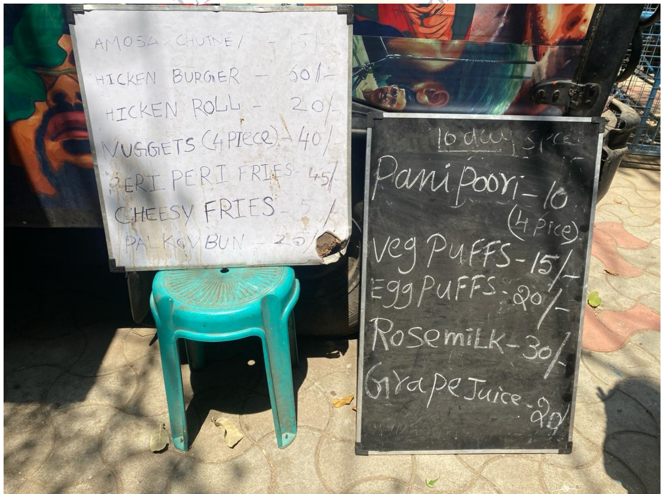
Price List of the Food and Beverages available in the Food Truck