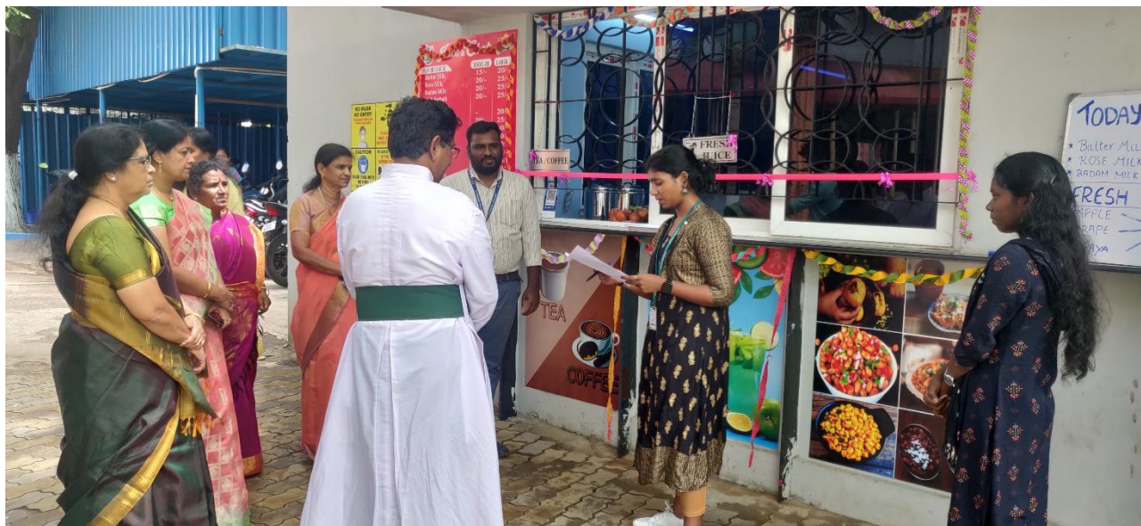
Prayer for Inauguration of the Faculty Startup