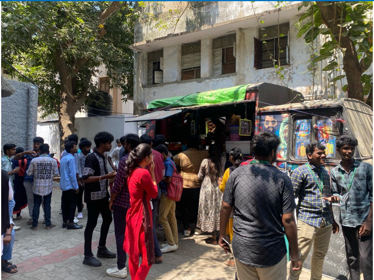
Students at the Food Truck